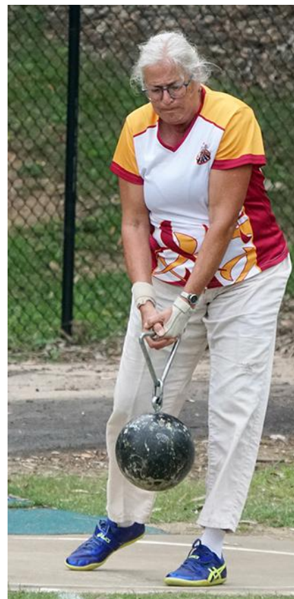
W35 1 Newington, Dash 17.36m